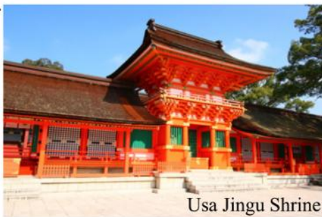
Usa Jingu Shrine