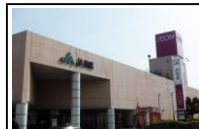
*Supermarket Convenient for your daily shopping Less than 5 min