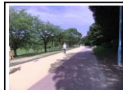
*kasuga Park, Shirouzu oike park Perfect place for your walk