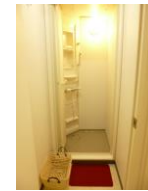
Shower room on each floor