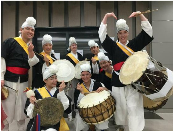
Korean Traditional Instrument 8/17(Thu)