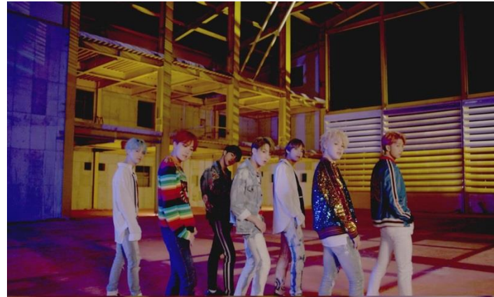
K-pop Dance 8/14(Mon)