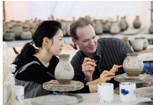
Making Pottery 8/7(Mon)