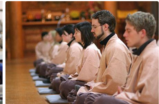
Temple Stay 8/16(Wed)