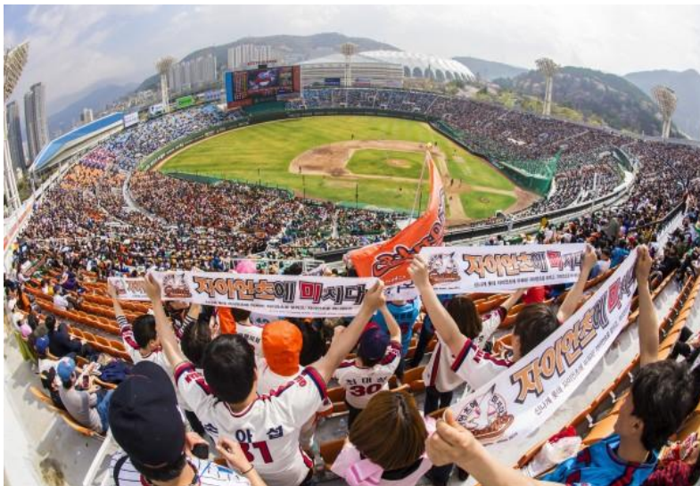
Baseball Game 8/14(Mon)